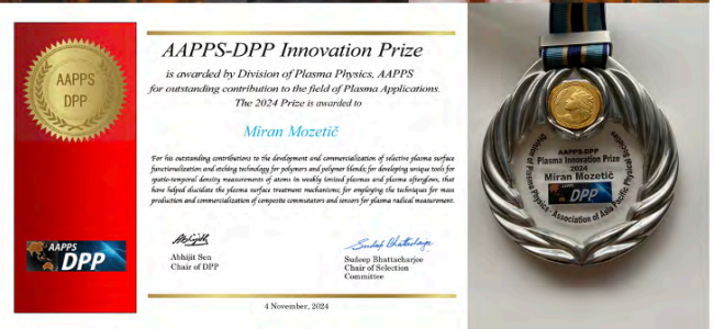
Fig. 4 2024 Plasma Innovation Prize certificate, 2024 Laureate Miran Mozetic, Selection committee chair Sudeep Bhattacharjee