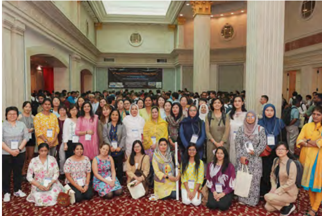
Figure 9 2 nd WIPP WS participants and Women Participants