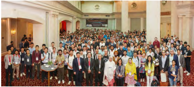
Figure 2 Group photo of participants