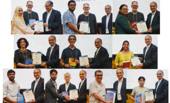
Figure 7 AAAPPS-DPP Poster Prize winner who received certificate and Springer book gifts

researchers. Among 130 poster presentations, 29 posters were selected by the selection committee chaired by A. Sen. Winners received certificate and a Springer book on plasma physics (when appeared in poster prize ceremony) http://aappsdpp.org/AAPPSDPPF/posteraward.html .