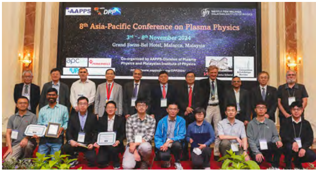
Figure 1 Opening session group photo of AAPPS-DPP2024

Division of plasma physics (DPP) annually holding Asia-Pacific conference on Plasma Physics. The eighth annual conference (AAPPS-DPP2024) was held at Grand Swiss Belhotel, Malacca, Malaysia during Nov 3-8, 2024. Figure 1 shows Opening session speakers and DPP award winners of AAPPS-DPP2024.